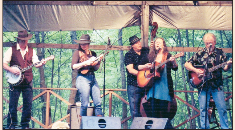
TEXAS ROSE BAND